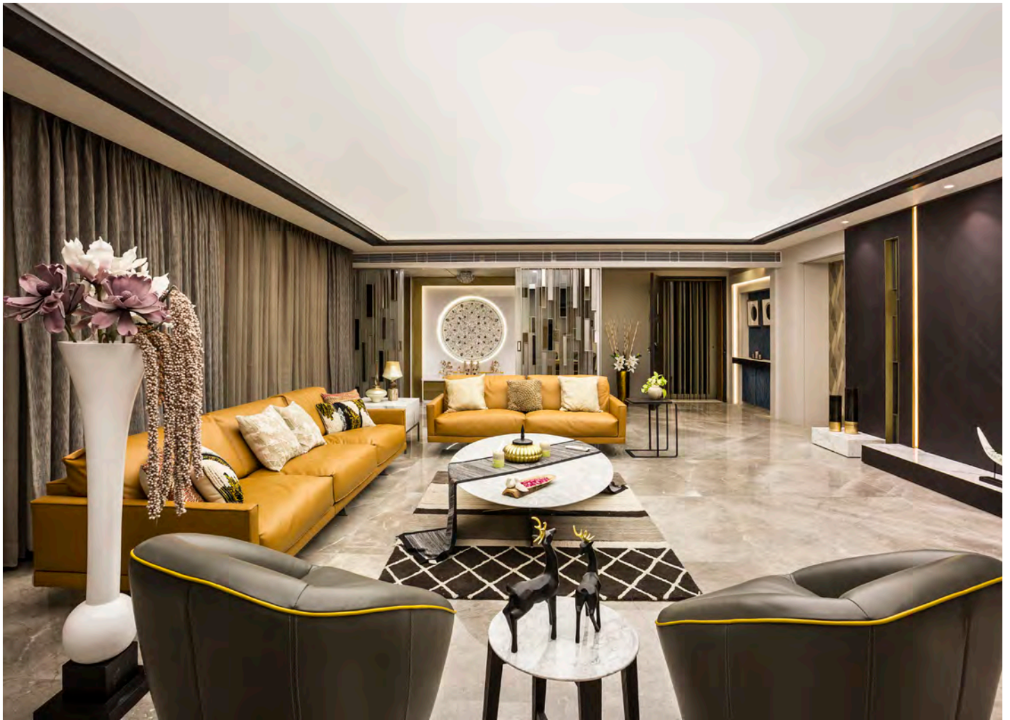
Private residence - INDIA - Backlit ceiling XXL - Installation: NAKSHATRA