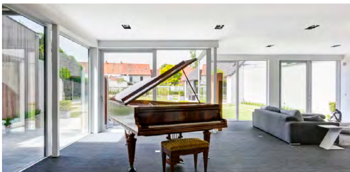
Residential - Living room - BELGIUM - White ceiling with lighting integration - Installation MonaVisa

...for the advantages of CLIPSO® for walls and ceilings in residential spaces: