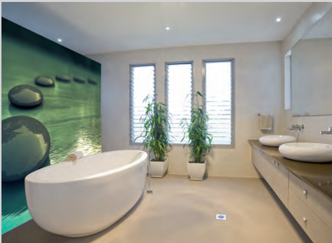
Residential - bathroom - Acoustic ceiling and printed canvas