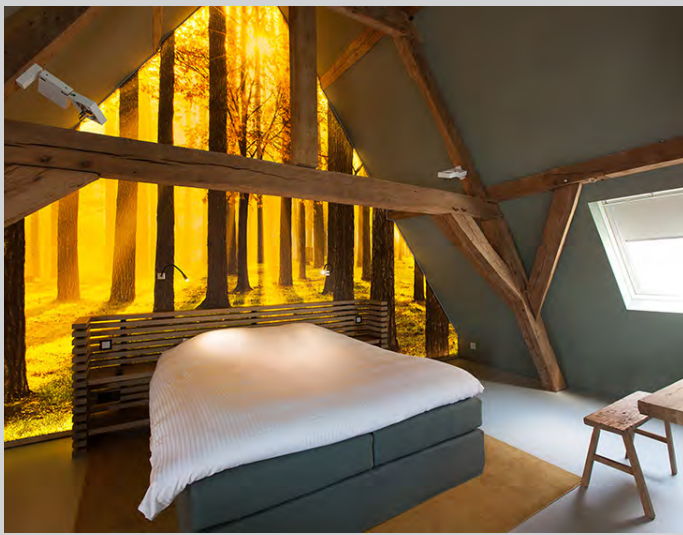
Residential - Bedroom - BELGIUM Backlit printed walls Installation: MonaVisa