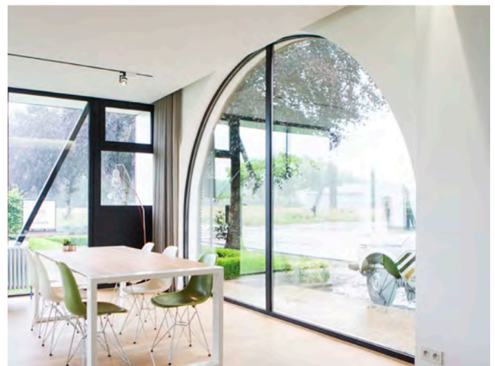
Private residence - BELGIUM - Acoustic ceiling Installation: MonaVisa