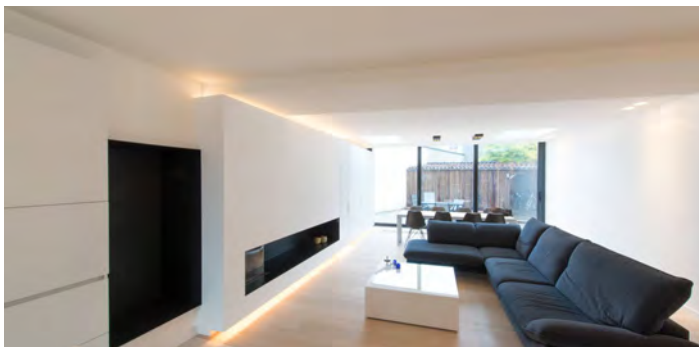
Residential - living room - BELGIUM - White ceiling Installation: MonaVisa